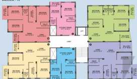
BLOCK - A