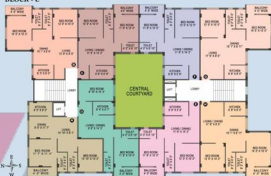
BLOCK - C