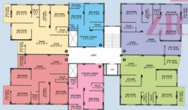
BLOCK - B